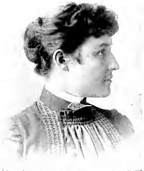
E. PAULINE JOHNSON.